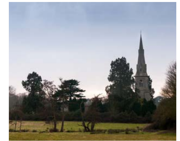
St. Mary's Church, Mistley