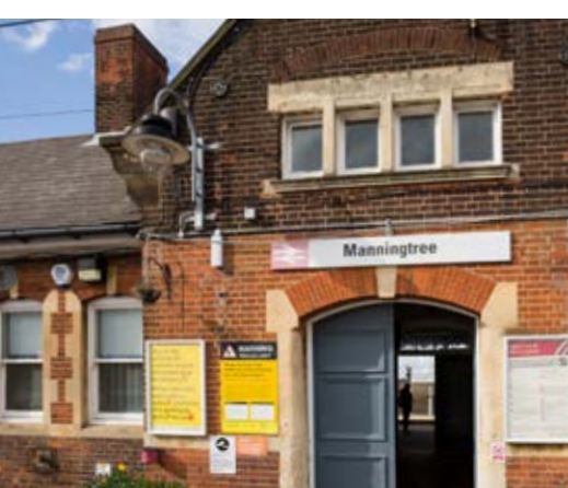
Manningtree Train Station

A more frequent and faster commuter service is provided from Manningtree Station which is 2.7 km (1.7 miles) away with a fastest journey time of less than an hour.