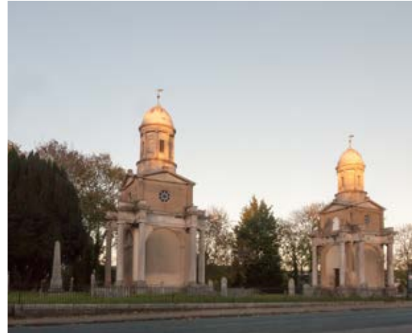
Mistley Church Towers