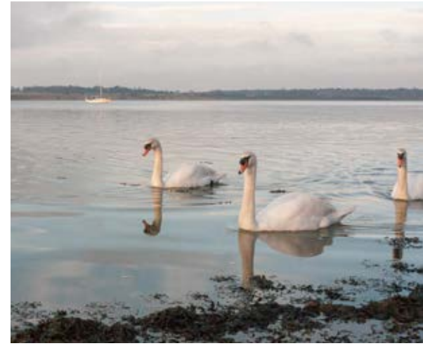
Mute swans on the River Stour